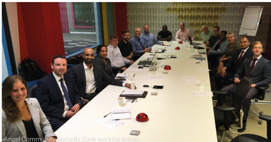
Angel Community Security Zone working group

The Community Security Zone is a working group made up of representatives from the larger employers at the Angel supported by our dedicated police team, working with the Met Police Counter Terrorism Unit.