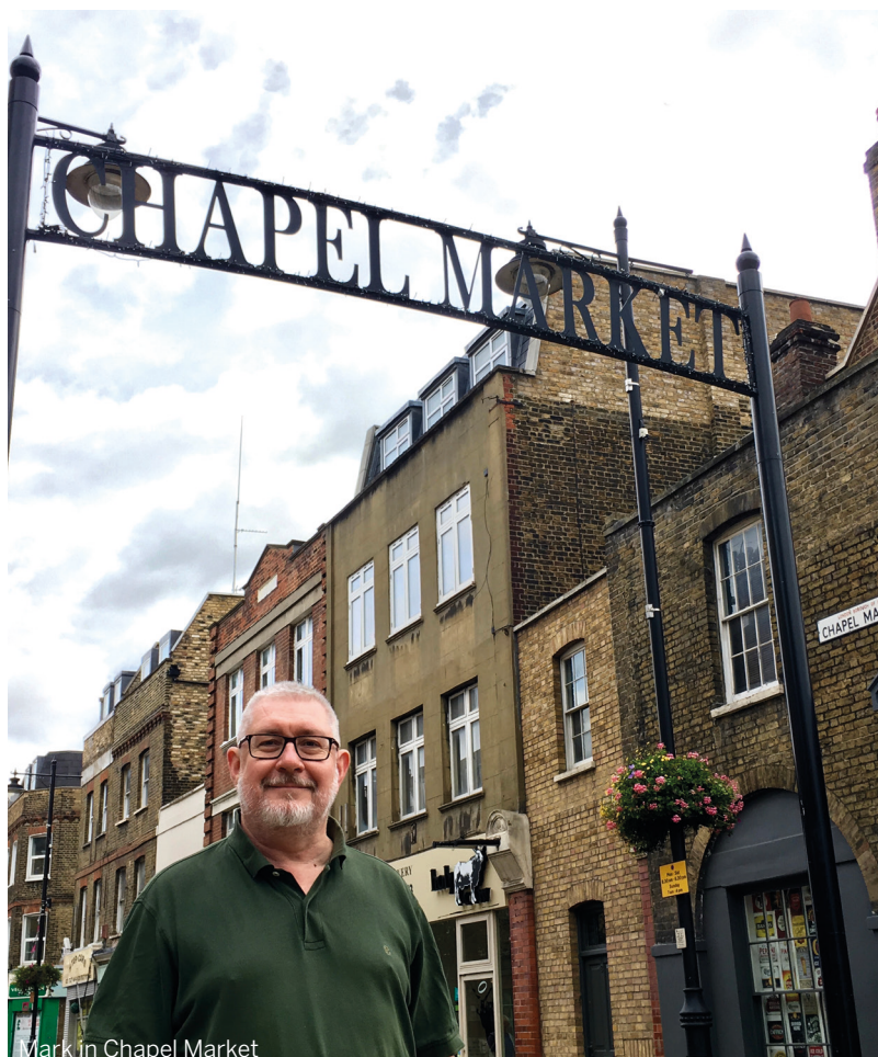
Mark in Chapel Market

The compactors will reduce the number of waste collections required from Chapel Market, freeing up the street for shoppers and subsequently helping businesses and traders. The compactors are scheduled to be in place next year.