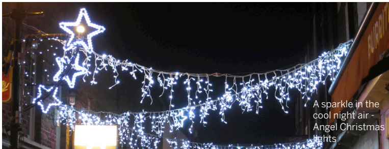
A sparkle in the cool night air - Angel Christmas lights

"Cameras will not only help with police investigations but also act as a deterrent. The Angel must be as safe as it can be for all of us who work, visit and live here."