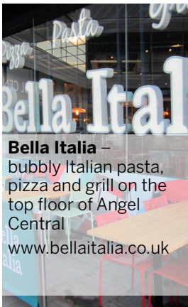
Bella Italia – bubbly Italian pasta, pizza and grill on the top floor of Angel Central www.bellaitalia.co.uk

Find out more or make a donation by calling 020 7700-2498, emailing savvas@piliontrust.org.uk or go to Just Giving www.justgiving.com/piliontrust/