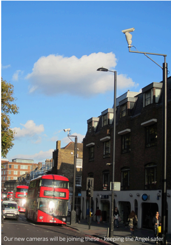
Our new cameras will be joining these - keeping the Angel safer

The newsletter from Angel Business Improvement District