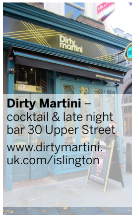
Dirty Martini – cocktail & late night bar 30 Upper Street www.dirtymartini.co.uk/islington