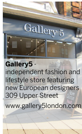
Gallery5 – independent fashion and lifestyle store featuring new European designers 309 Upper Street www.gallery5london.com