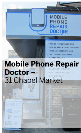
Mobile Phone Repair Doctor – 31 Chapel Market