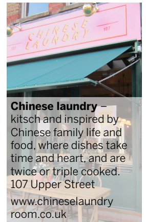
Chinese laundry – kitsch and inspired by Chinese family life and food, where dishes take time and heart, and are twice or triple cooked. 107 Upper Street www.chineselaundryroom.co.uk