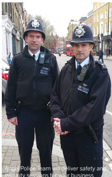
Angel Police Team will deliver safety and security sessions for your business