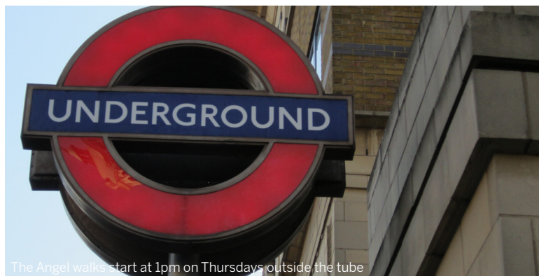
The Angel walks start at 1pm on Thursdays outside the tube