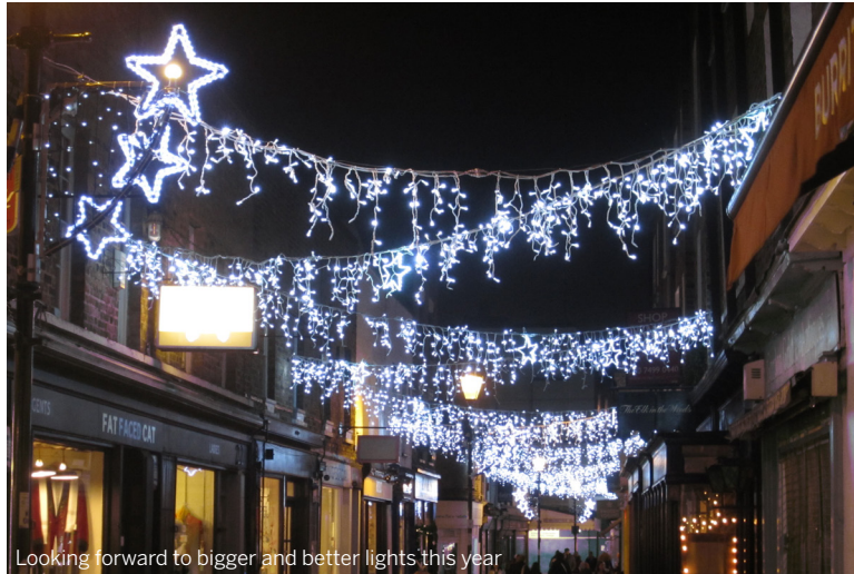
Looking forward to bigger and better lights this year

Come to our security session with experts from the Bank of England and our Angel Police Team to show you how to spot the dud new notes. It's at 9am on 31 October in Candid Arts Studios, 5 Torrens Street. It will last an hour, teach you all the security features of the notes, what to do if you mistakenly accept one, and is free and exclusive to ALL angel.london businesses.