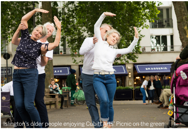
Islington's older people enjoying Cubitt Arts' Picnic on the green