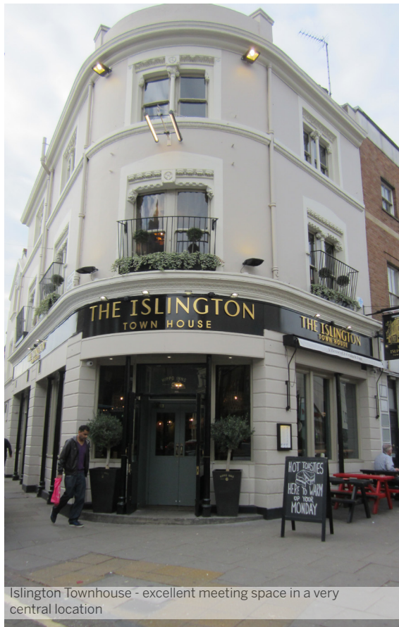
Islington Townhouse - excellent meeting space in a very central location

We're paying for ten more footfall monitors and will install them on a first come, first served basis. All you need is a plug point and power supply near the front of your premises. Call us to book yours on 020 7288 4377