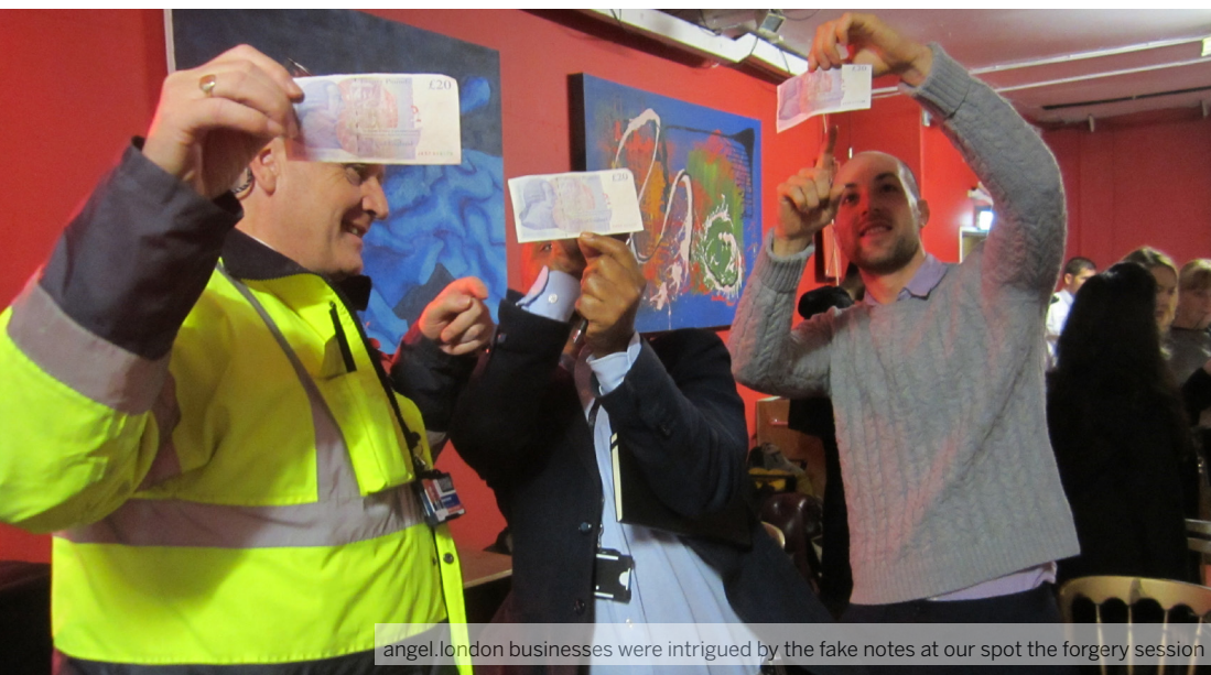
angel.london businesses were intrigued by the fake notes at our spot the forgery session