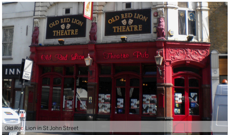
Old Red Lion in St John Street

Thanks to angel.london business Islington Townhouse on the corner of Chapel Market and Liverpool Road for generously hosting the seminar.